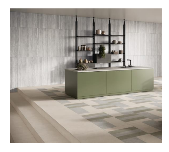
Motif 6: So-called 'typicals' demonstrate the combinatorics of SOLID GROUND's designs, colours and formats.