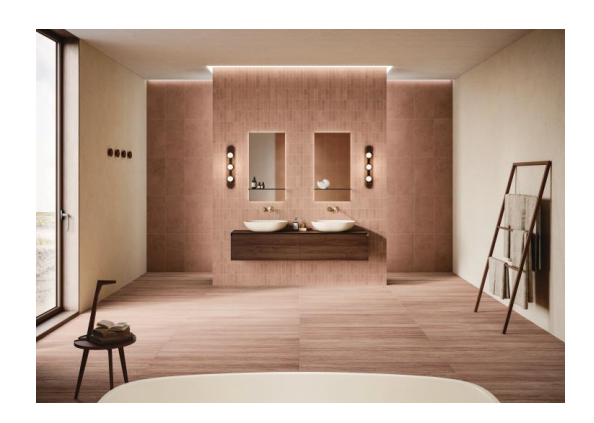
Motif 3: One of six colour tone pairs: concrete look and travertine form a harmonious atmospheric unit in red clay and Persian red.