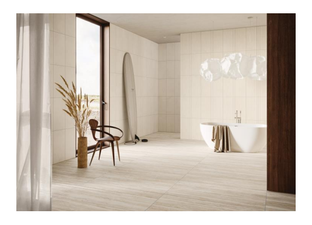
Motif 4: The matt stoneware tiles in 30 x 60 cm for the wall: a perfect match in smooth and gently relief. Shades: grey green, natural white and Belgian grey. The fine wave profile creates an additional haptic level.