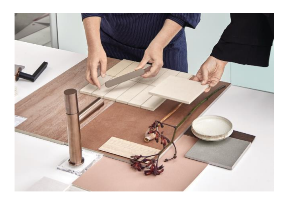
Motif 2: The individual elements can be intelligently combined to create something unique from your own imagination.