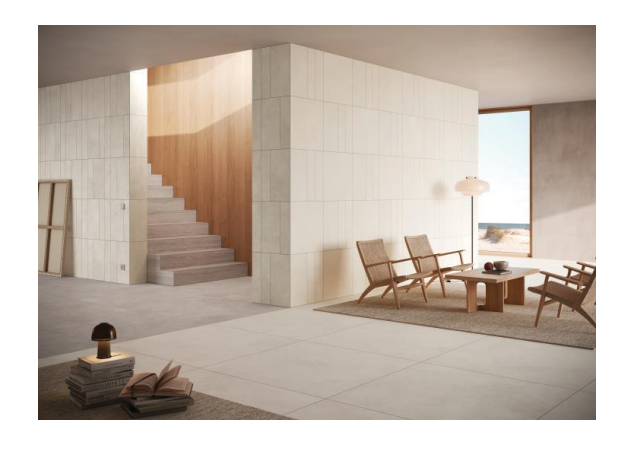
Motif 5: Finely graded shades of grey structure and zone different areas of use. The 145 cm long travertine step offers space for a complex design.